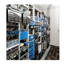
REAL TIME SIMULATION