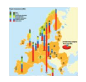
SMART GRIDS PROJECTS