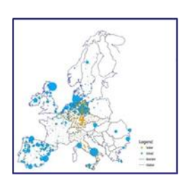
PROJECTS OF COMMON INTEREST